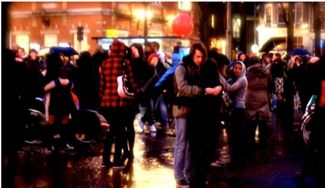
A Live Cinema Show directed by Everyone; act on the street, watch a movie in the street.

Audiences were invited to download an MP3 and turn up at a secret location to listen to the track at a specified time. On the soundtrack the audience would hear the composed soundtrack along with narration and instructions. Two MP3 files were made available, so the audiences